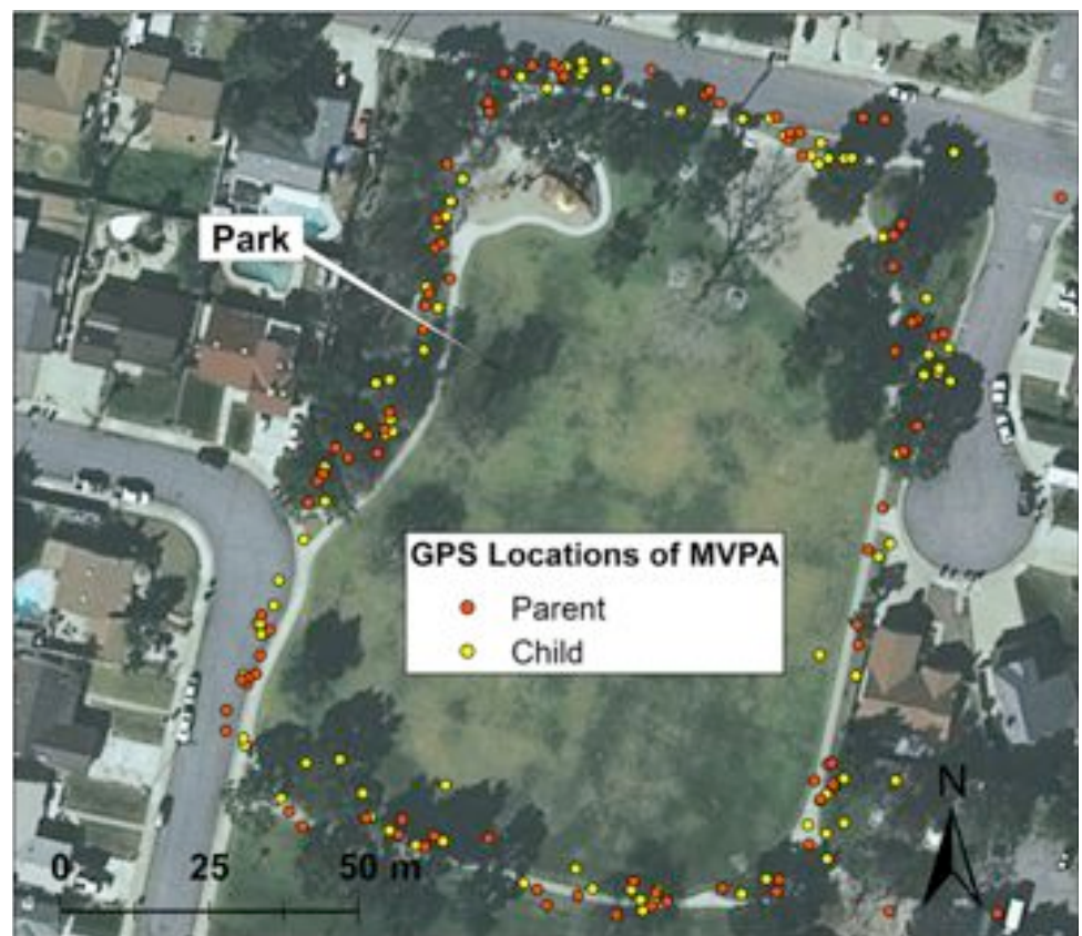
Figure 2. Example of parent and child performing MVPA together at a location classified as open space.